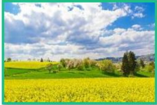
Accelerating farming systems transitions: agroecology living labs and research infrastructures