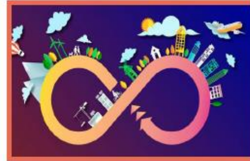
Outside the work programme - institutionalised partnership Circular Biobase Europe (CBE)