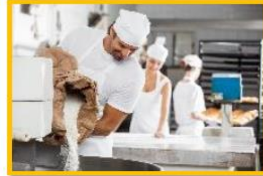
Safe and sustainable food systems for people, planet and climate