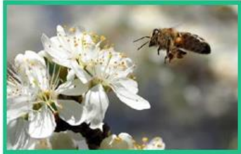
Rescuing biodiversity to safeguard life on Earth (2021)