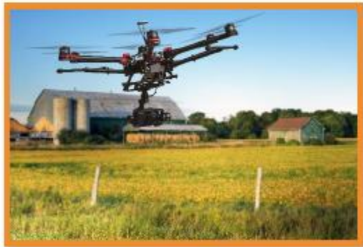
Agriculture of data