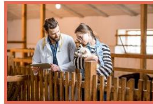
Animals and health