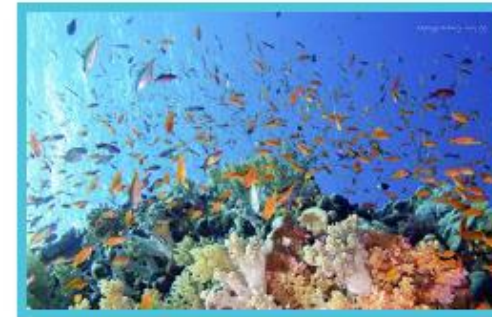
Climate neutral, sustainable and productive blue economy (2022)